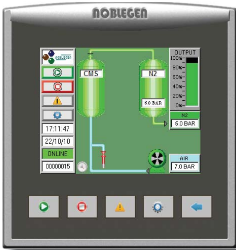
model NG1-1 shown